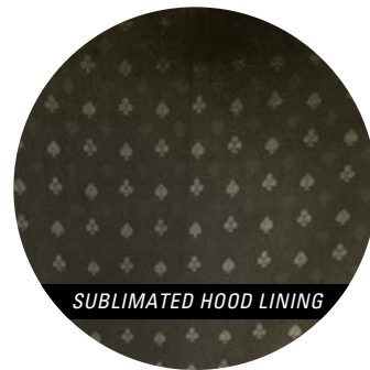
SUBLIMATED HOOD LINING