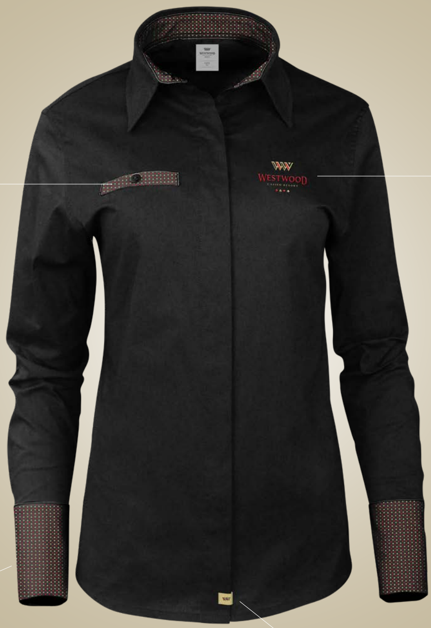
SUBLIMATED POCKET WELT