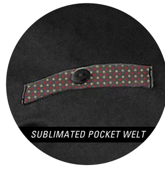
SUBLIMATED POCKET WELT